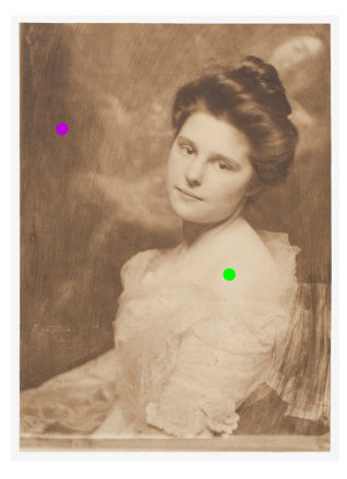
Figure 2. (below) XRF spectra from the Dmax, Dmin, mount, and background signal produced by the analyzer.

Figure 1. (right) Locations of XRF measurements